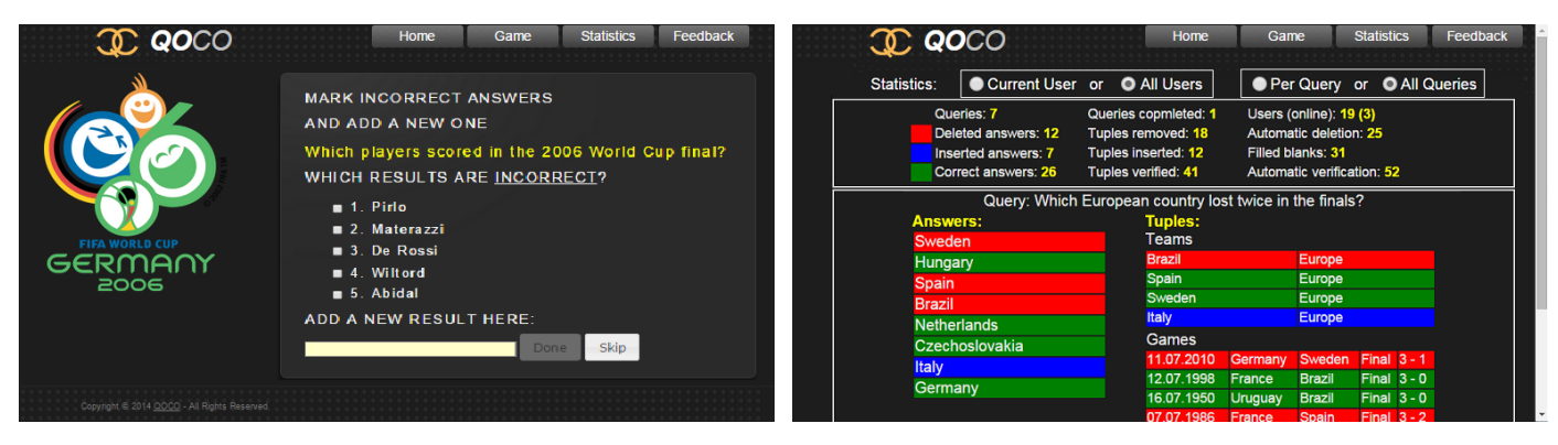
Figure 3: QOCO UI: mark incorrect/add missing answers