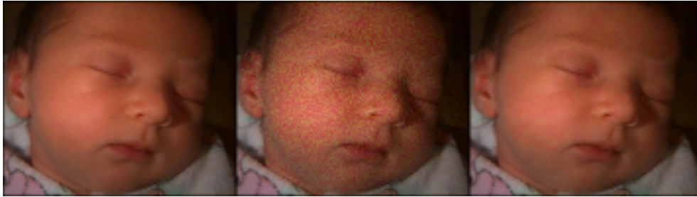
Fig. 2. The HSV color model captures human color perception better than the RGB model which is the common way our machines represent colors. The original image (left), the noisy image (middle) and the filtered image (right) demonstrate the effect of the flow as a denoising filter in the HSV color space. For further examples follow the links at http://www.cs.technion.ac.il/~ron/pub.html