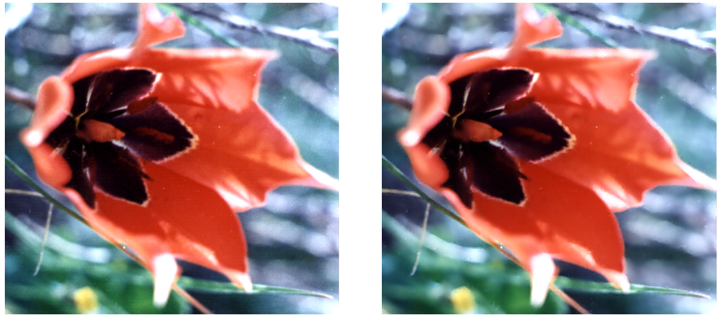
Fig. 2. Left - original tulip, right - enhanced and denoised tulip. 40 iterations, [k_f, k_b, w] = [0.7, 5, 3] * MAG, \rho = 1